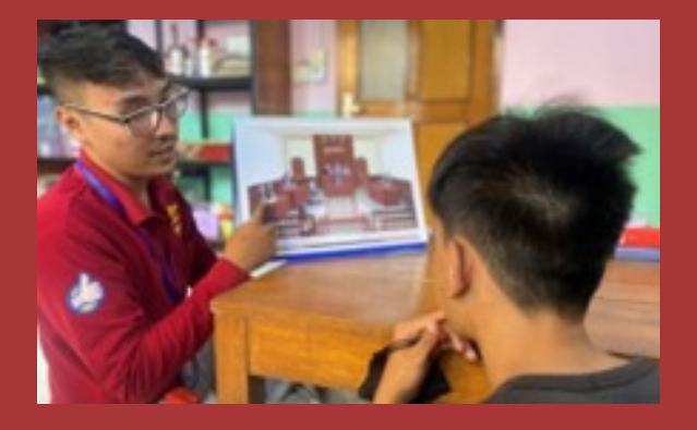
Explaining the court process helps to prepare youth when testifying in court.

53 youths actively participated as members of M'Lop Tapang's Kids' Network.