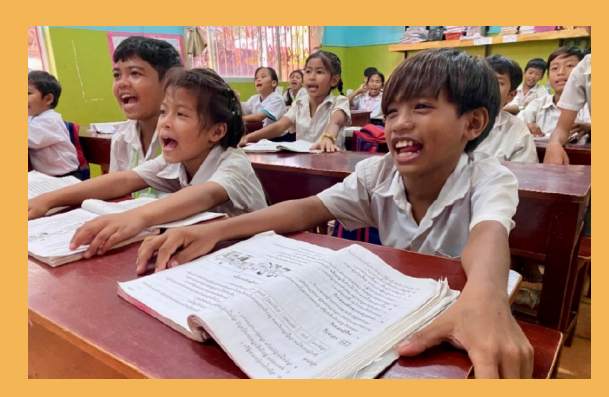
Every child has the right to education regardless of their financial situations.

The "Back to School program " supports children from low-income families to attend and stay in local public schools.