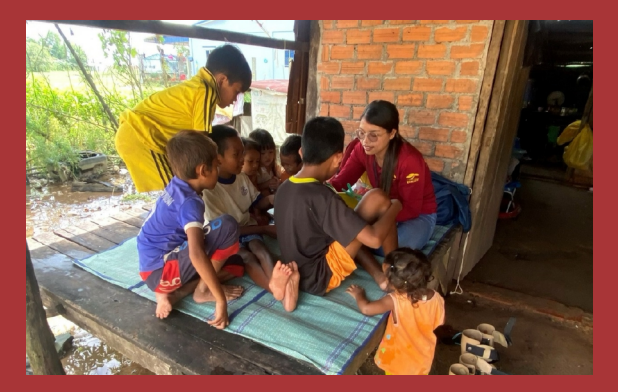
Working with children at their homes in the community.

91 children and youths received services through the Special Needs Program (7 new this year)