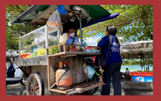
Meeting ChildSafe agents on the beach.

2,228 calls were received on our 24-hour Confidential Hotline