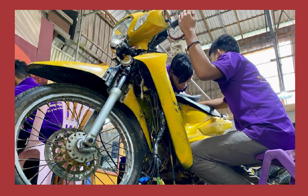
Motorbike repair is one of the most popular vocational training programs.

46 students participated in motorbike repair training.