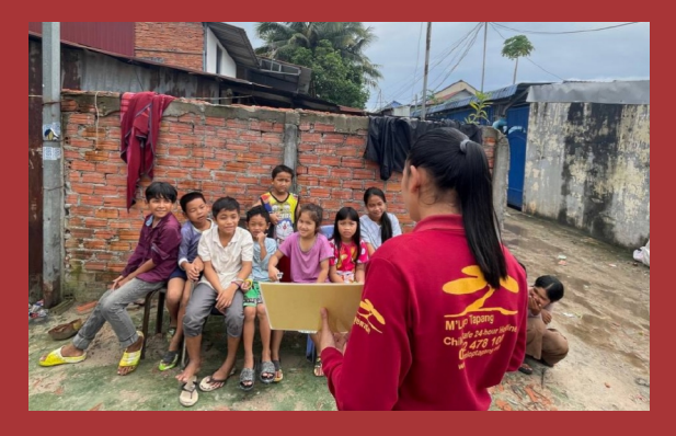
Providing awareness education to children and youth in the community.

50 clients (31 female/19 male) in Keo Pos (government drugs center) were provided with scheduled support.