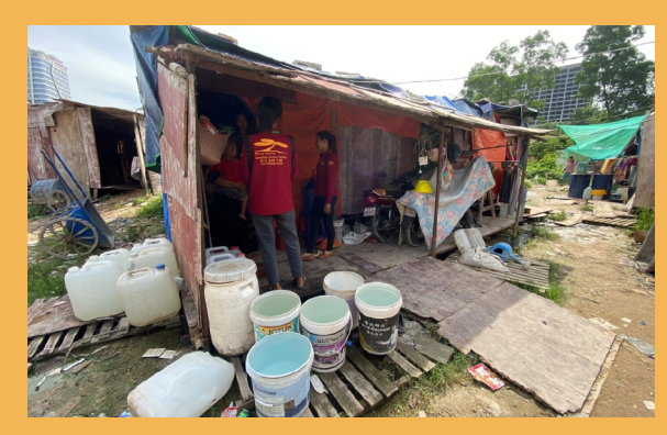
Social workers visit the poorest areas of Sihanoukville.

Our social workers provide a variety of family support services, including practical interventions like training, business start-ups, emergency food assistance, psychosocial support, and referrals to other services.