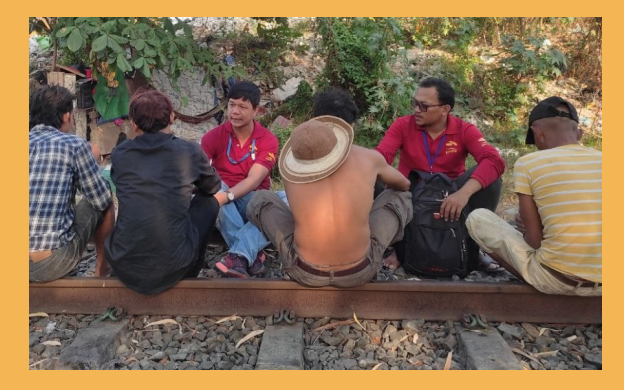
Building relationships with community members that struggle with addiction issues.

The team assists people with substance addiction difficulties by providing support directly in the community, at 'Pteah Romchang' (MT's Rehab and Detox Center), and at the nearby prison. Awareness education is provided in local neighborhoods, through MT programs, as well as in public schools.