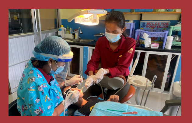
Providing free dental care.

Seeing patients in M'Lop Tapang's Medical Clinic