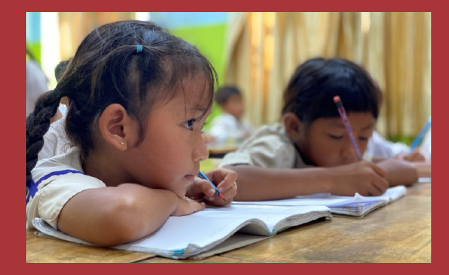
50% of the students in M'Lop Tapang Education Programs are girls.

1,538 children/youths attended local public schools with the support of our " Back to School " program ( 489 were new this year)